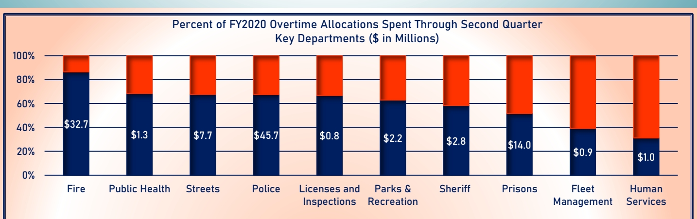
Percent of Allocation Spent in Q2 Percent of Allocation Remaining

Fast Fact: PICA focuses on 10 key departments responsible for 96.6% of overtime spending